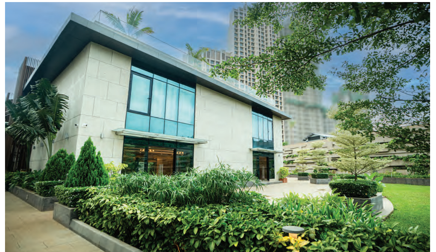
EXTRAVAGANT 20,000 SQ. FT. CLUBHOUSE (OC-RECEIVED)