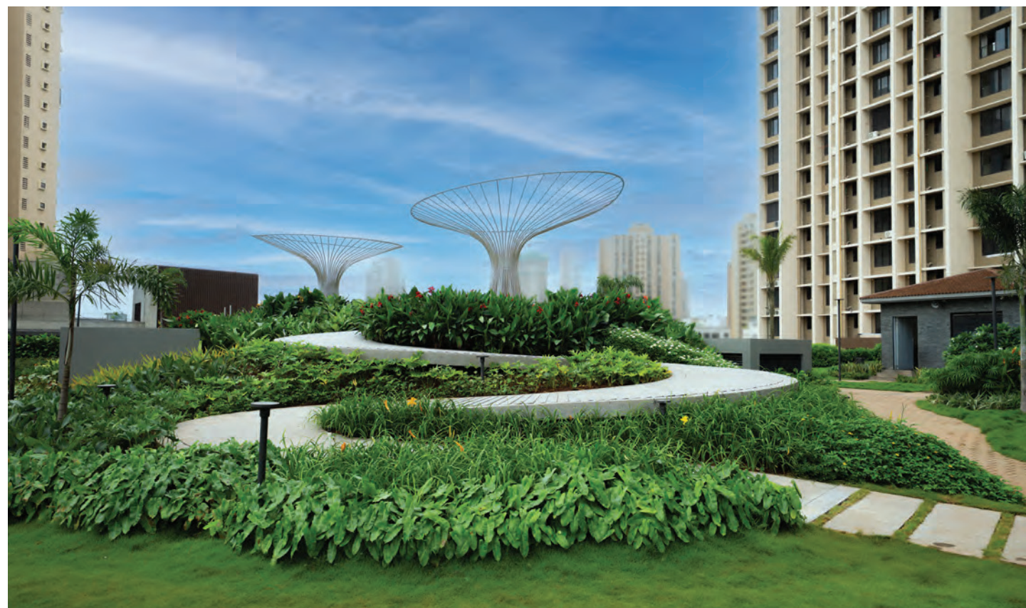
PODIUM DREAM GARDEN (2 ACRES APPROX.)