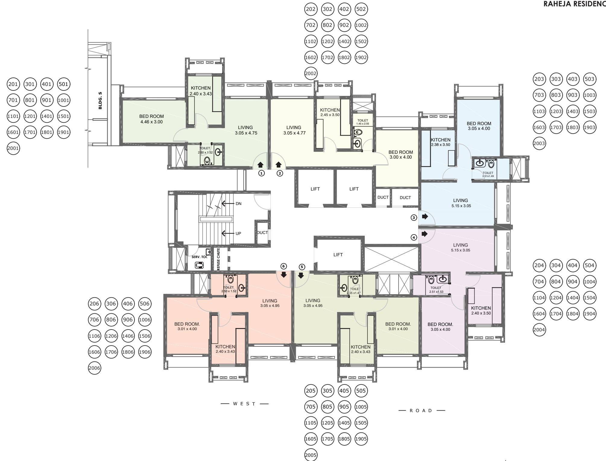
TYPICAL FLOOR PLAN (2nd to 5th, 7th to 12th, 14th to 20th) RESIDENTIAL BUILDING - T AT MALAD (EAST), MUMBAI.