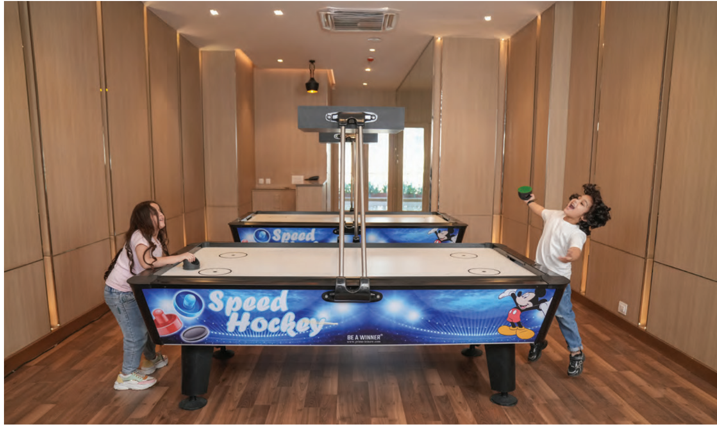
INDOOR PLAY AREA