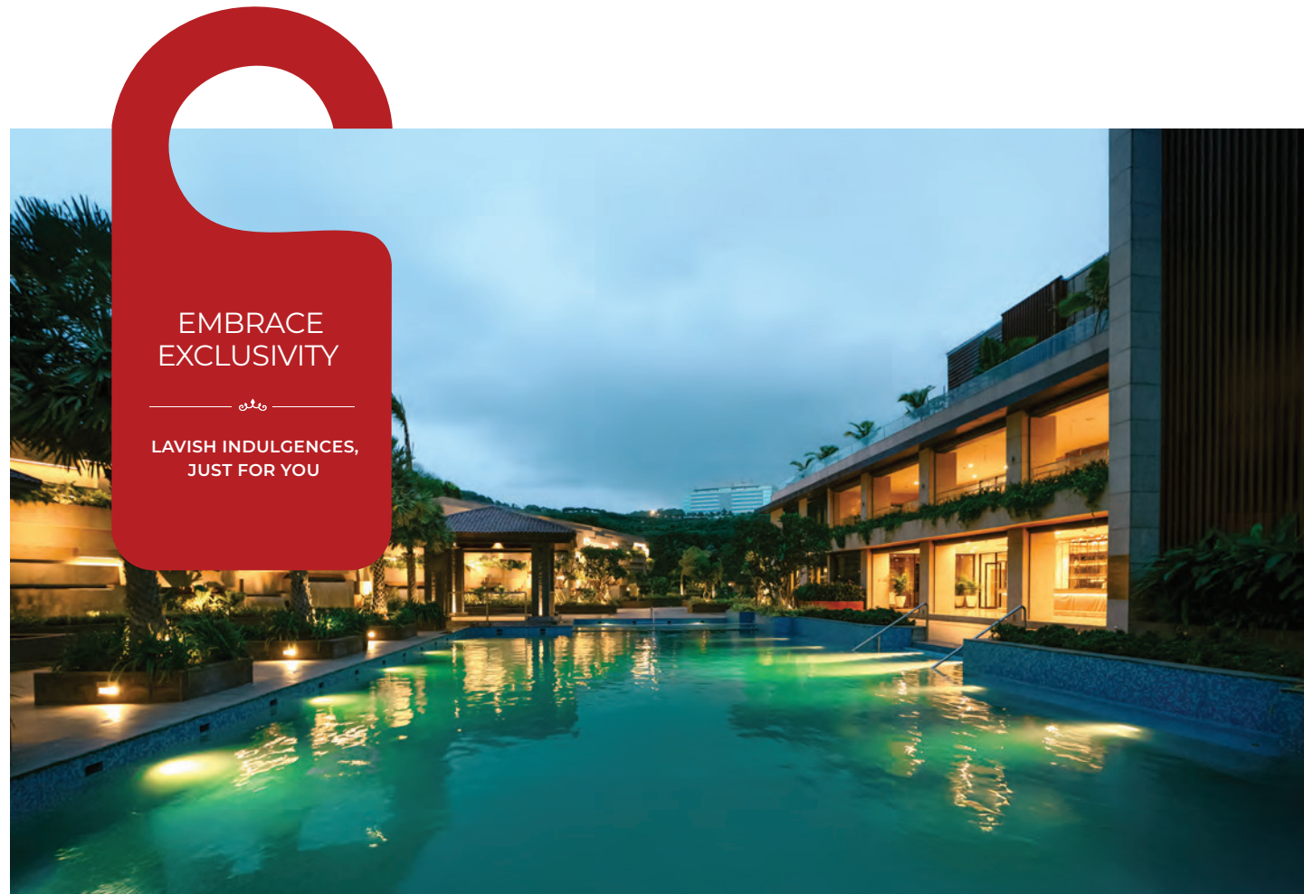
RESORT-STYLE SWIMMING POOL AMIDST BREATHTAKING LANDSCAPE