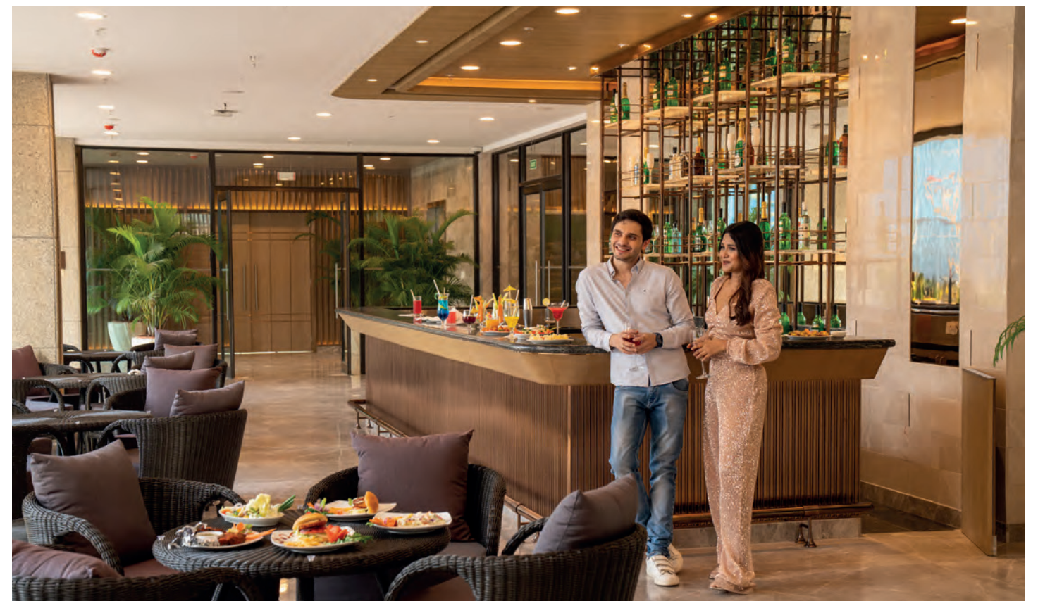
HOLISTIC LIFESTYLE THAT BLENDS CONVENIENCE WITH LUXURY

ALL ARE ACTUAL PHOTOGRAPHS. SHOT ON LOCATION